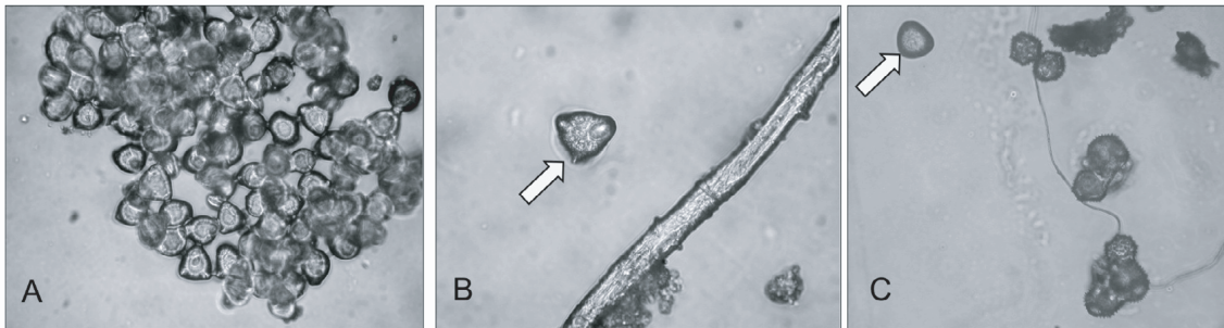
Figure 1. Wind-transported apple pollen grains observed on pollen traps at different distances and orientations from the pollen-dispenser tree. A. Apple pollen grains 4 m north of the pollen dispenser tree. B. Apple pollen grains (white arrow) 14 m west of the pollen dispenser tree. C. Apple pollen grains (white arrow) 20 m north of the pollen-dispenser tree. The remaining pollen grains originated from Taraxacum officinalis .