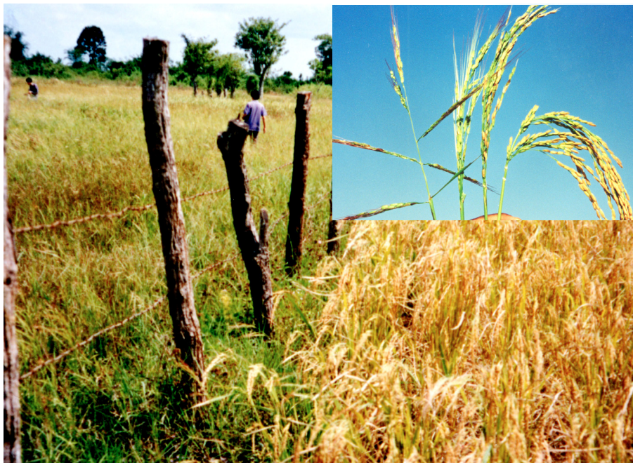
Figure 2. Hybrids and introgression types of rice are commonly found in the bordering area between cultivated (right) and wild (left) rice species. The picture on up-right corner shows the close-up of the perennial common wild rice ( Oryza rufipogon , left), Asian cultivated rice ( O. sativa , right), and the progeny of their spontaneous hybrids resulted from gene flow (two in the middle).